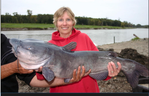
Rod & Reel Rally Catfishing Tourney, Drayton