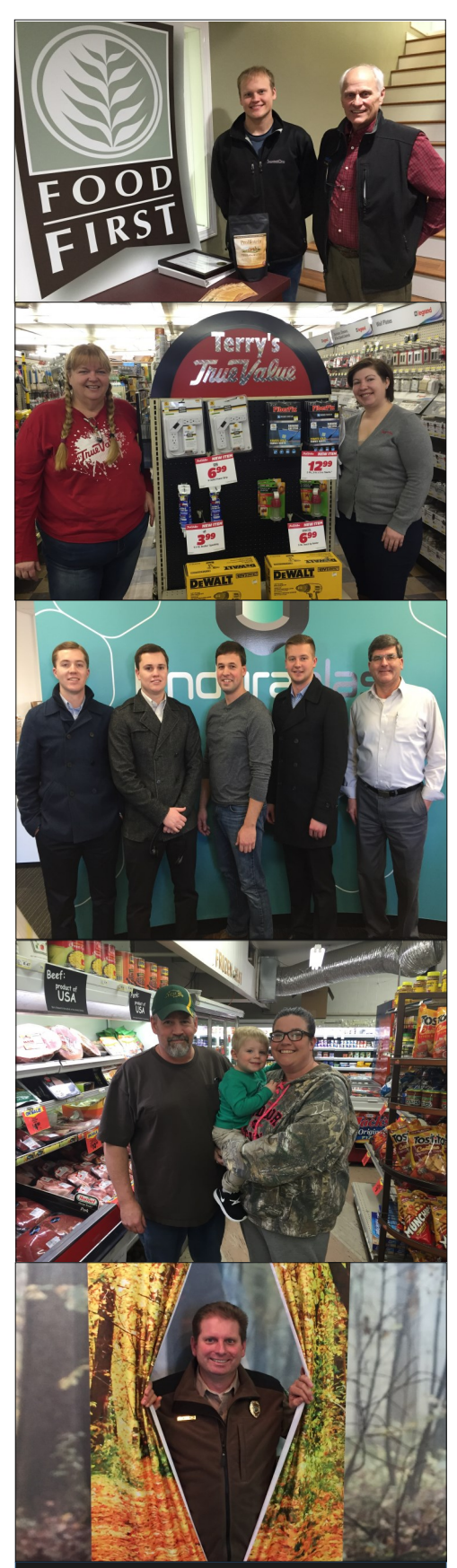
Pictured from top: Food First, Terry's True Value, Enduraplas, D & K Grocery, Icelandic State Park