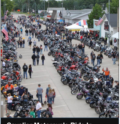
Cavalier Motorcycle Ride In

A visitor is defined as someone who has travelled 50+ miles or completes an overnight stay. A study done by the ND Department of Commerce – Tourism Division found that in 2013, Pembina County saw $38.42 million in visitor spending. This was a 9.8%