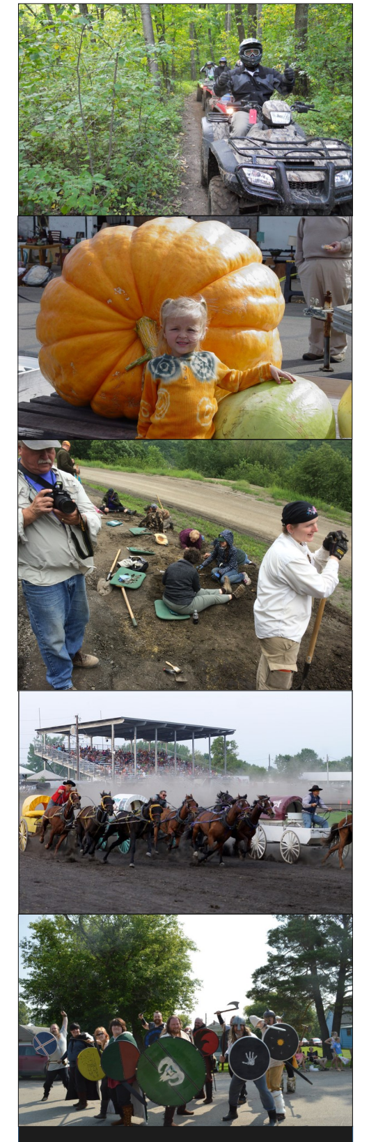
Pictured from top: OHV Trails, Pembina Gorge; Pumpkin Fest, Walhalla; Fossil Dig, Pembina Gorge; Pembina County Fair, Hamilton; Deuce of August Icelandic Festival, Mountain

drive thousands of visitors to the region year round.