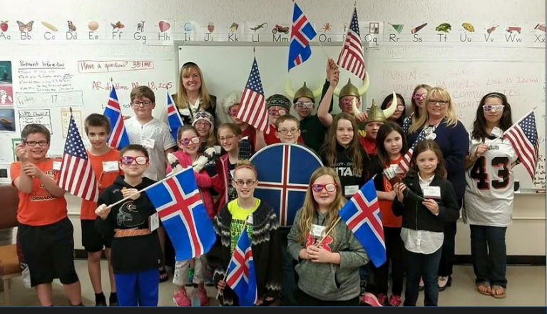
Marketplace for Kids - 600 Attendees in Cavalier, April 2015